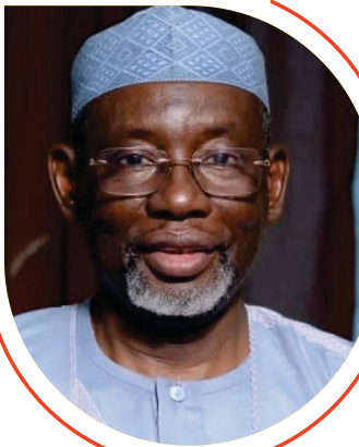
HIS EXCELLENCY, UMAR NAMADI GOVERNOR, JIGAWA STATE