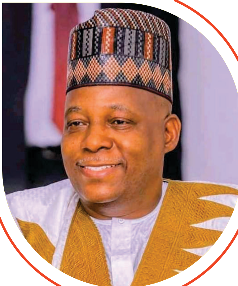
HIS EXCELLENCY, KASHIM SHETTIMA (GCON) VICE PRESIDENT OF FEDERAL REPUBLIC OF NIGERIA