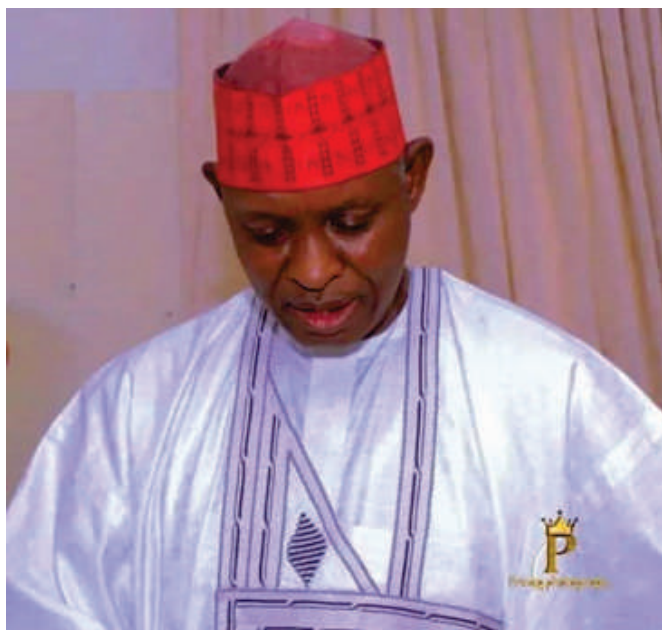
ALH. ABBA KABIR YUSUFU, Executive Governor, Kano State

“On behalf of Governor of Kano State and the sister States in the Northwest Region, I thank the organizers of this laudable event and state our readiness to partner on the Nigeria Bio-Economy Programme for the growth and development of our dear country” were his concluding remarks.