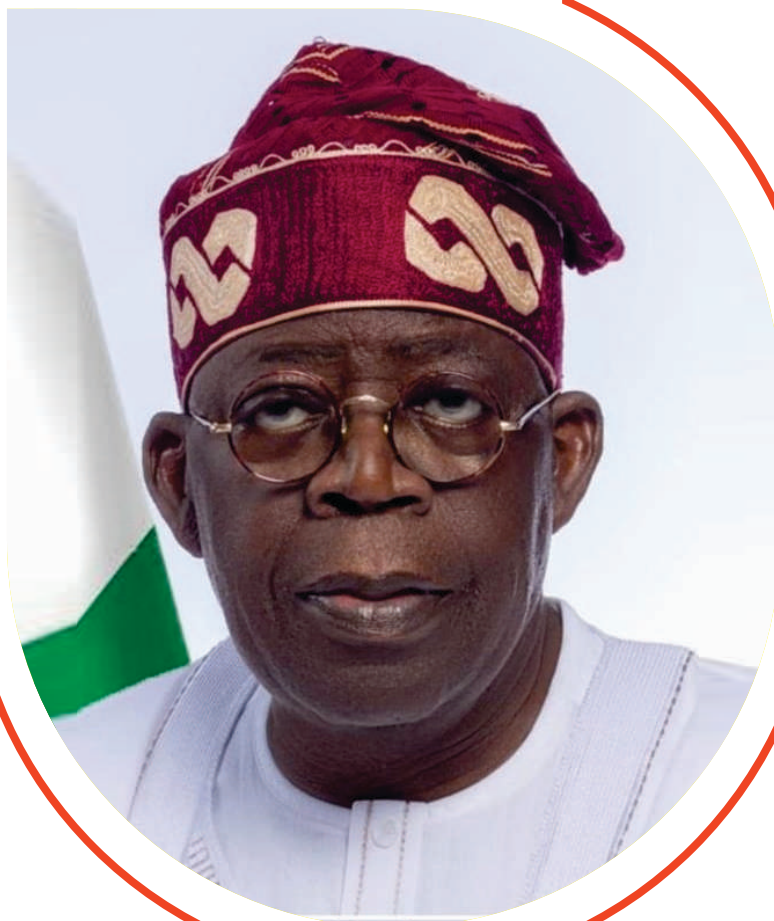
HIS EXCELLENCY, BOLA AHMED TINUBU (GCFR) PRESIDENT AND COMMANDER IN-CHIEF OF THE ARMED FORCES FEDERAL REPUBLIC OF NIGERIA