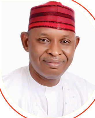
HIS EXCELLENCY, ABBA KABIR YUSUF GOVERNOR, KANO STATE